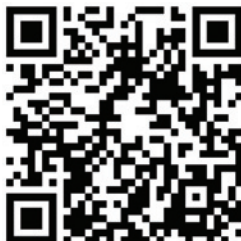
Movie 100 kg Feed & Take-up