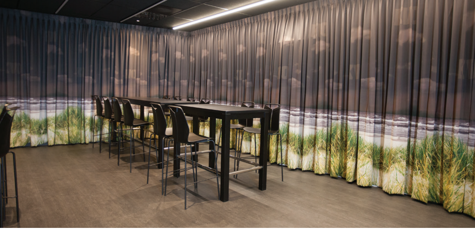
Customised curtain design at Versluys Arena - KV Oostende

To be in line with the stunning and modern complex, KV Oostende decided to go for entirely customised curtains. Using our digital printers, we were able to offer the designers exactly what they had in mind, something that otherwise would not be possible. On top of that, we realised the whole project within a very short timeframe. This added value gives us a clear advantage over our competitors."